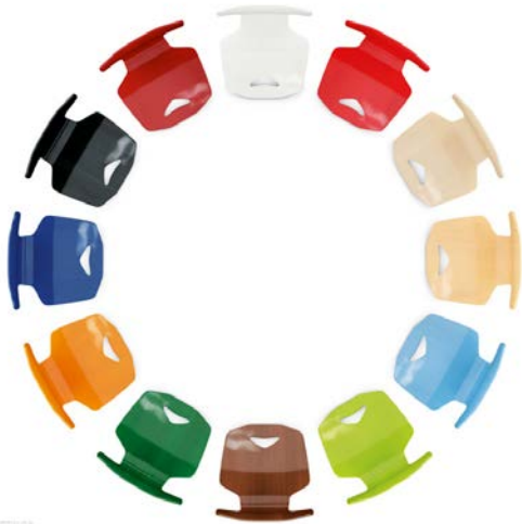
Jumper Chair, 2017-2019 by Jean Nouvel for VS America.