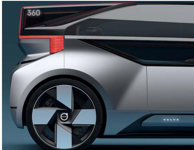
Volvo 360c Concept, 2018 by Safety Center Team, Volvo Cars.