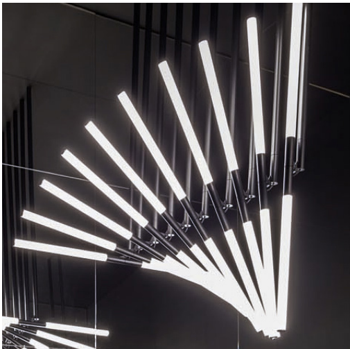
XY180 Light, 2018 by Rem Koolhaas, OMA for Delta Light.