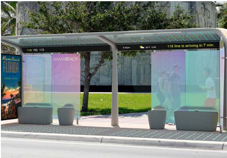
City of Miami Beach Bus Shelters designed by Pininfarina, 2018.