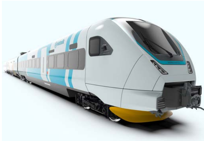
ZEFIRO Express, 2019 by Bombardier Transportation.